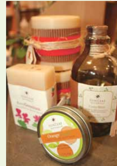
Sunleaf Naturals products.

This is a young, soft, creamy Gouda. The best thing about this cheese, however, is that it is made from delicious southern Wisconsin grass-fed milk. The family farmers of Edelweiss Graziers operate within guidelines that emphasize rotational grazing — their cows eat no silage. The wholesome diet of the cows is reflected in the fresh, grassy flavor of the cheese. In making this product, the cows are treated humanely, the farmers are paid a fair price for the milk, and co-op shoppers get a great artisan cheese at a reasonable price. — Scott