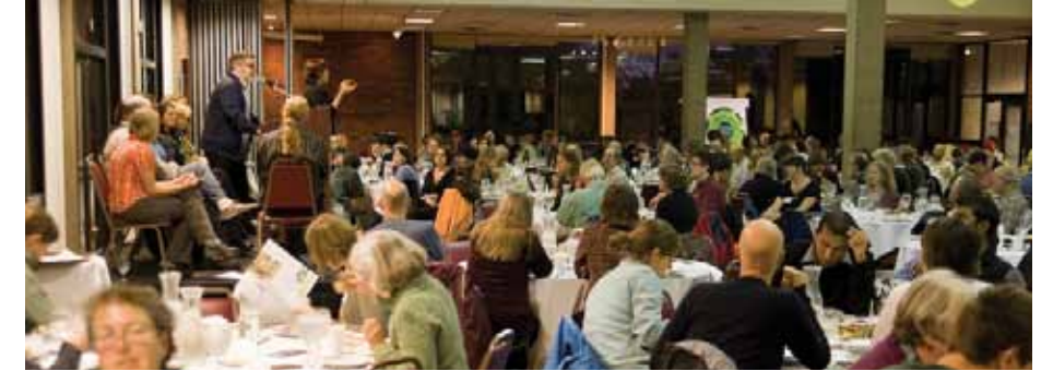
Co-op members enjoy dinner and conversation at the 2010 annual meeting at Augsburg College.

In the larger geography, there are also hybrid cooperatives around the United States that mix and match several forms of the cooperative model into their business workings. Many of these are, interestingly, food co-ops. For more on this topic, visit the National Cooperative Business Association (NCBA) at www.ncba.coop . The NCBA will give you more information on the cooperative business model and will even assist you with starting your own cooperative.