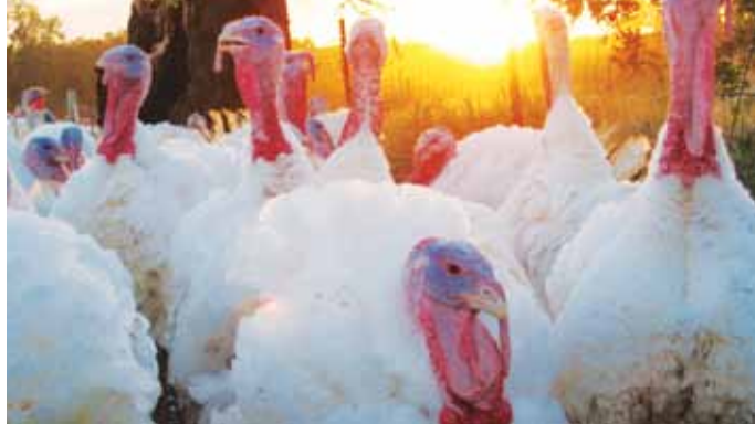
(Far left) Garlic kielbasa from the co-op's Meat & Seafood department, roasted sweet potatoes and braised greens. (Top) Turkeys from Ferndale Farms near Cannon Falls, Minn. at sunset.