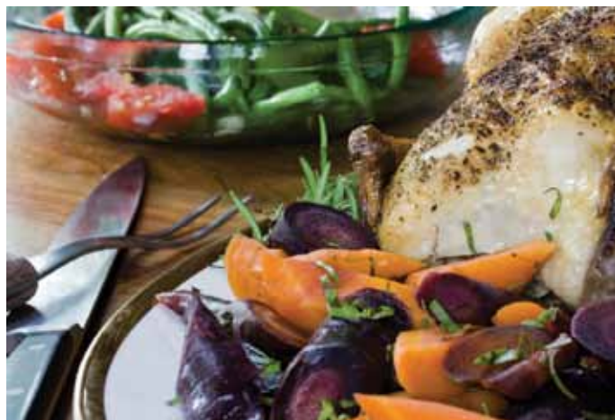
(Bottom) Roasted purple and orange carrots with basil, rosemary-garnished Deli rotisserie chicken, and green bean and heirloom tomato salad with mint.